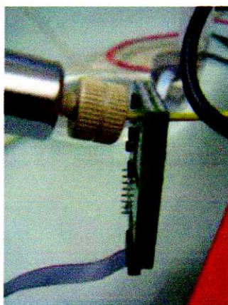
Figure 1. Planar Headstage on 1/16th inch tubing after the column

The method used was similar to experiments previously published*, except contactless (as opposed to contact) conductivity detection was used.